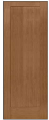
FIR 1-PANEL SHAKER