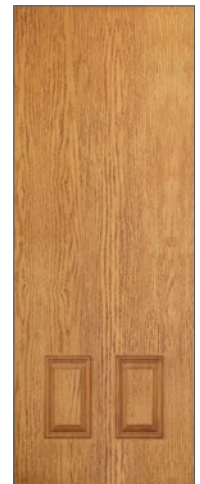
2-PANEL BLANK TOP Shown in Norwood