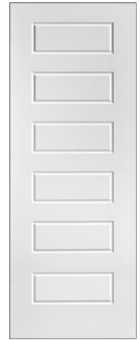
6-PANEL HORIZONTAL Shown in Cambridge