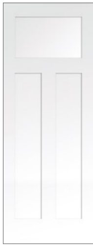
SMOOTH 3-PANEL SHAKER