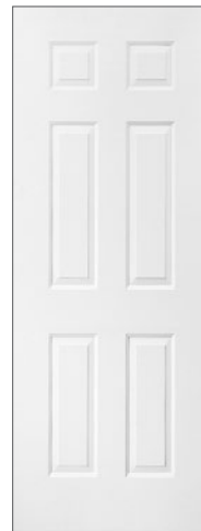
6-PANEL STD Shown in Trukote