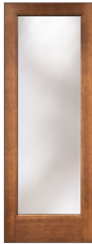
FIR DIRECT GLAZED 1-LITE