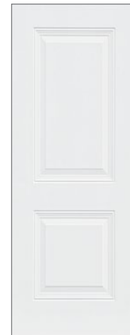
2-PANEL HD Shown in Trukote