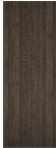
FLUSH Shown in Trugrain Rockport