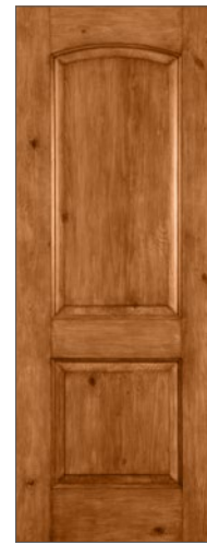
KNOTTY ALDER 2-PANEL ARCH TOP