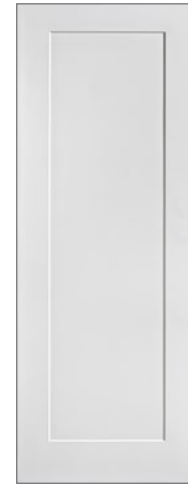
1-PANEL SHAKER Shown in Cambridge