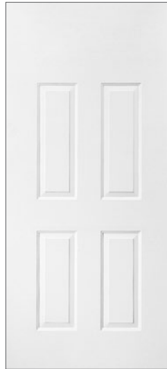
4-PANEL BLANK TOP

ADA ♠90 H 6'8" 7'0" W 2'6" 2'8" 2'10" 3'0"