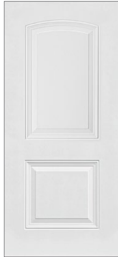
2-PANEL HD ARCH TOP

ADA ♠90 H 6'8" 7'0" 8'0" W 2'8" 2'10" 3'0"